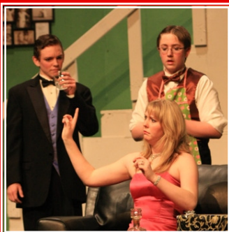
Cast of Rumors

In an effort to get the competitive juices flowing in the Weight Room ; the West High Football coaching staff has devised a system of round robin competitions to conclude their afternoon workouts.