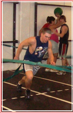
West High Athletes In Competition

Players can say anything they want, but if they don't back it up with performance and hard work, the talking doesn't mean a thing.